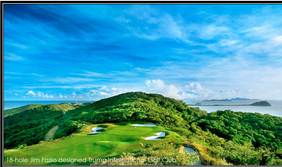
18-hole Jim Fazio designed Trump International Golf Club